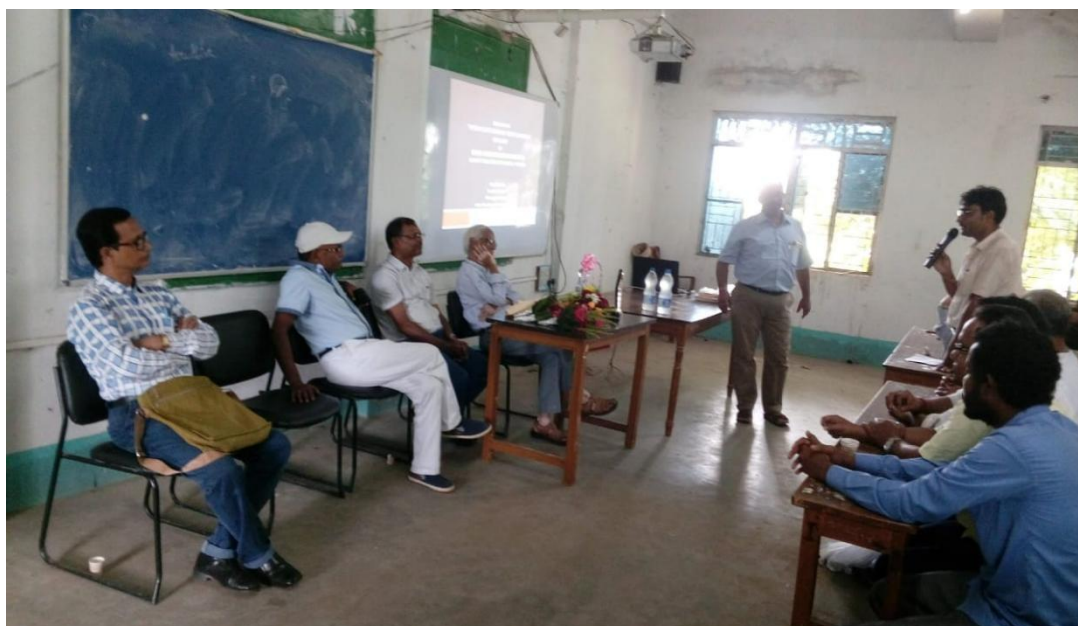
Few moments of the seminar