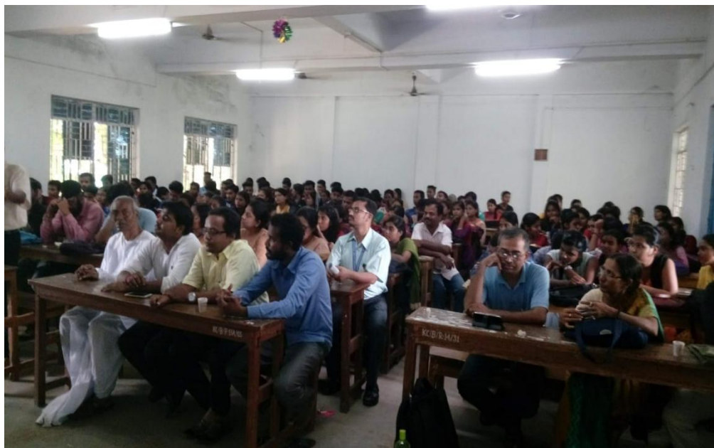
Photograph of the audience