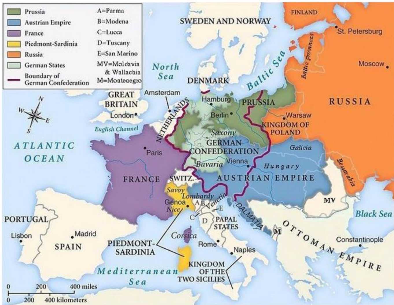
European boundaries set by the Congress of Vienna, 1815

This map of Europe, outlining borders in 1815, demonstrates that still at the beginning of the 19th century, Europe was divided mostly into empires, kingdoms, and confederations. Hardly any of the entities on the map would meet the criteria of the nation-state.