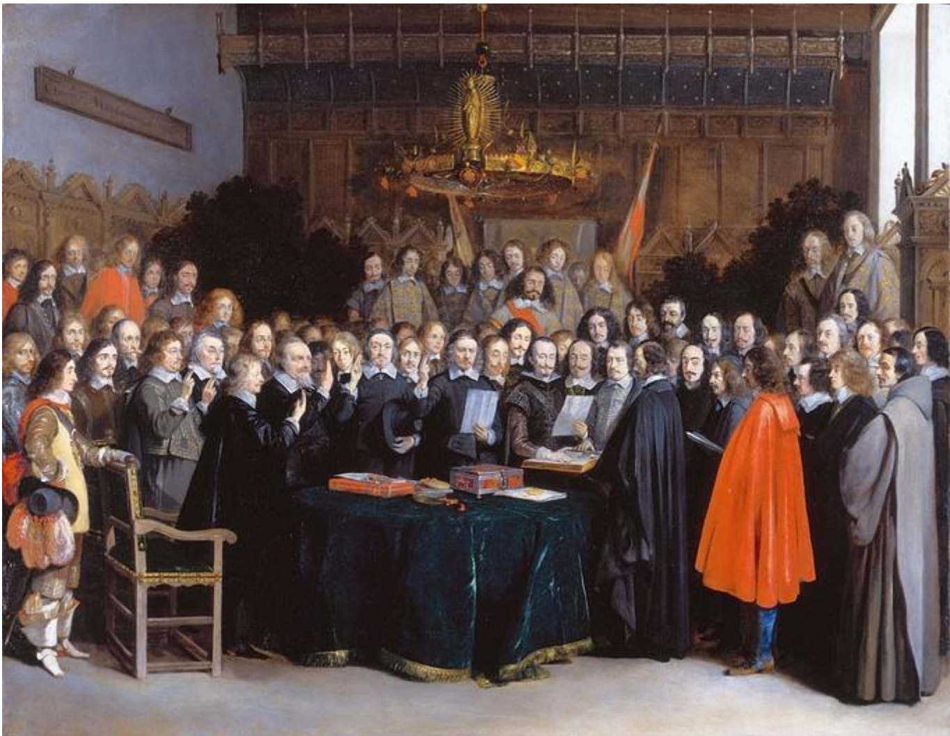
The Ratification of the Treaty of Münster, 15 May 1648 (1648) by Gerard ter Borch.

After the fall of the Soviet Union, power was seen as unipolar with the United States in absolute control, though nuclear proliferation and the rise of Japan, the European Union, the Middle East, China, and a resurgent Russia have begun to recreate a multipolar political environment. Instead of a traditional balance of power, inter-state aggression may now be checked by the preponderance of power, a sharp contrast to the Westphalian principle.